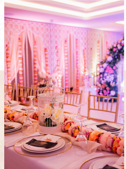
The Nova Suite

Four stunning suites, from 50 to 800 guests, tailored for celebrations of every scale and style.