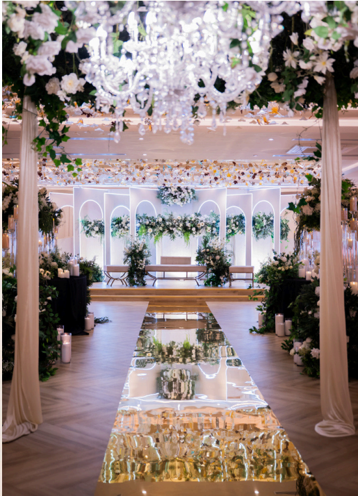
The Royal Suite