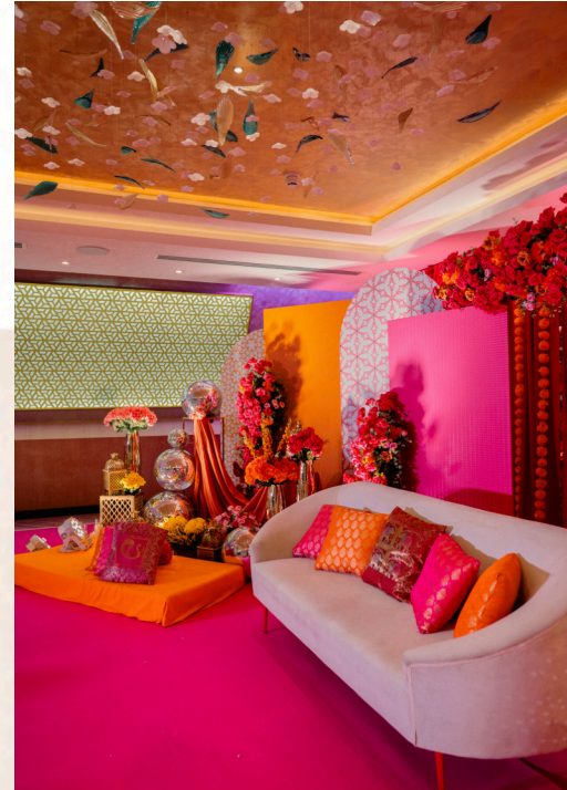
The Orion Suite